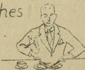
Plate Lunches Sandwiches Steaks Soups Short Orders