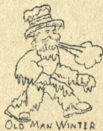
OLD MAN WINTER