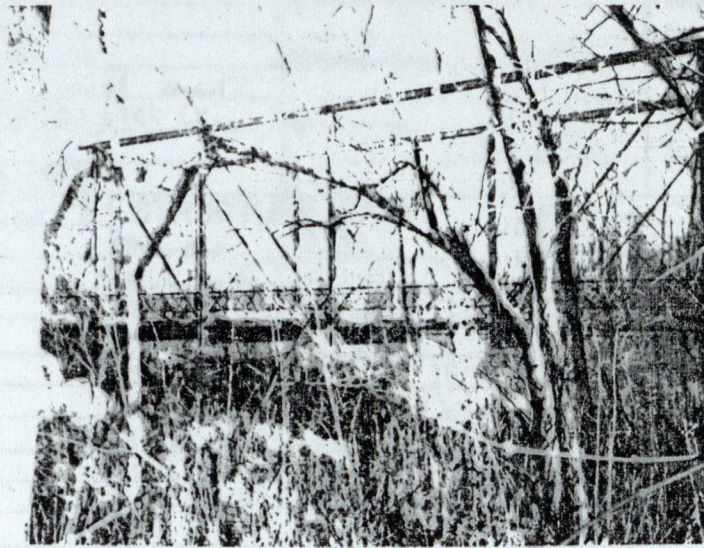
LOOKING SOUTHWEST BRIDGE NO. 182 WARREN TRUSS